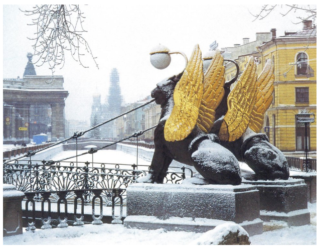
The Bank Bridge in Winter

t. Petersburg is nice and charming not only in summer, but also in winter. Winter landscapes in combination with magnificient architecture makes the city really great. The nature of the area in winter helps one feel and understand the severe beauty of the North capital of Russia.