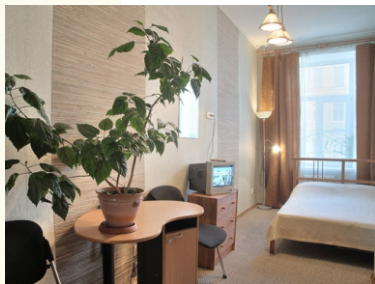
Our hostel. Double room

The school have the possibility to accommodate students in our shared flats as well as in the apartment for rent. All accommodations are located in the city-centre and not far from the school.