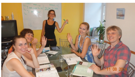
We offer courses in small group

During the course we offer rich cultural program including excursions and tours to other Russian cities. Some excursions are, so called, study excursions, when a guide uses “adapted” Russian to help the students not only get some extra vocabulary knowledge, but also to practice there conversational skills. These excursions are arranged in the way that even a beginner will not waste the time but enlarge his Russian vocabulary. Study excursions are the part of the educational program and usually are devoted to different topics covered in classrooms.