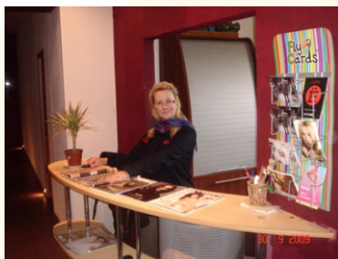
Our hostel. Reception.