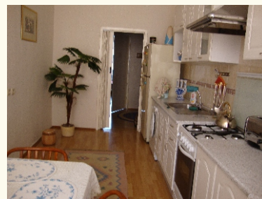
Our shared flat